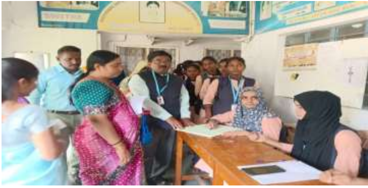
“Field Visit to Udumgal Gram Panchayathi”