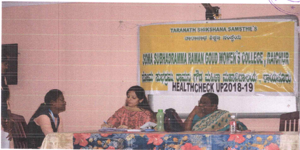
Medical Checkup Organized by Medical Unit on 15-03-2019 to 16-03-2019