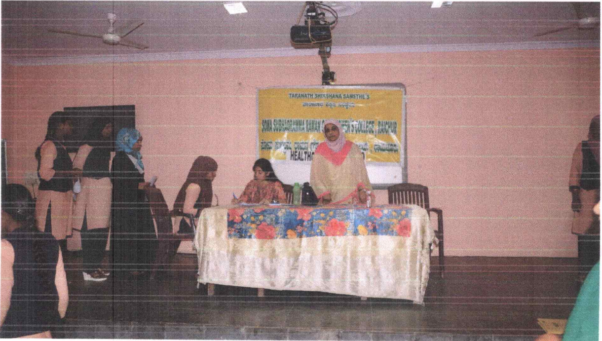
Medical Checkup Organized by Medical Unit on 15-03-2019 to 16-03-2019