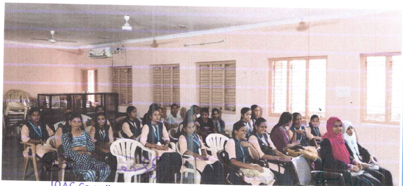
IQAC Co-ordinator S.S.R.G. Women's College, RAICHUR-584 101.