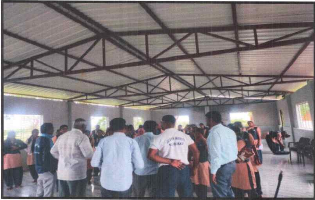
Voter's awareness Program

The S.S.R.G women's college Raichur, has organized extension activities on Voter's Awareness programme in udamgal - khanapur on 25/7/2023 at 12:00 p.m. all the NSS volunteers are given the Voter awareness to the peoples in Udamgal – Khanapur Village. Total 50 students and staff member were present