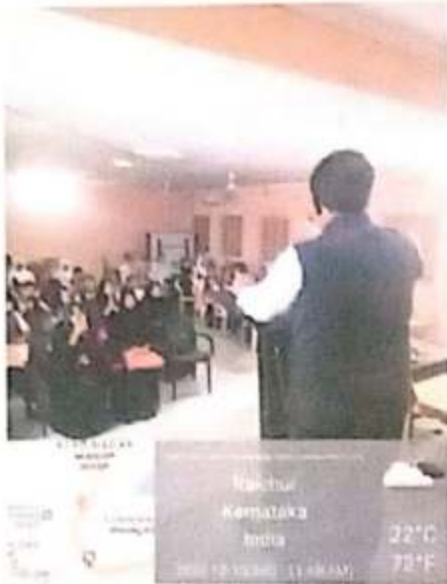
PHOTO GALLERY OF 5 DAYS SOFT SKILL TRAINING PROGRAMME