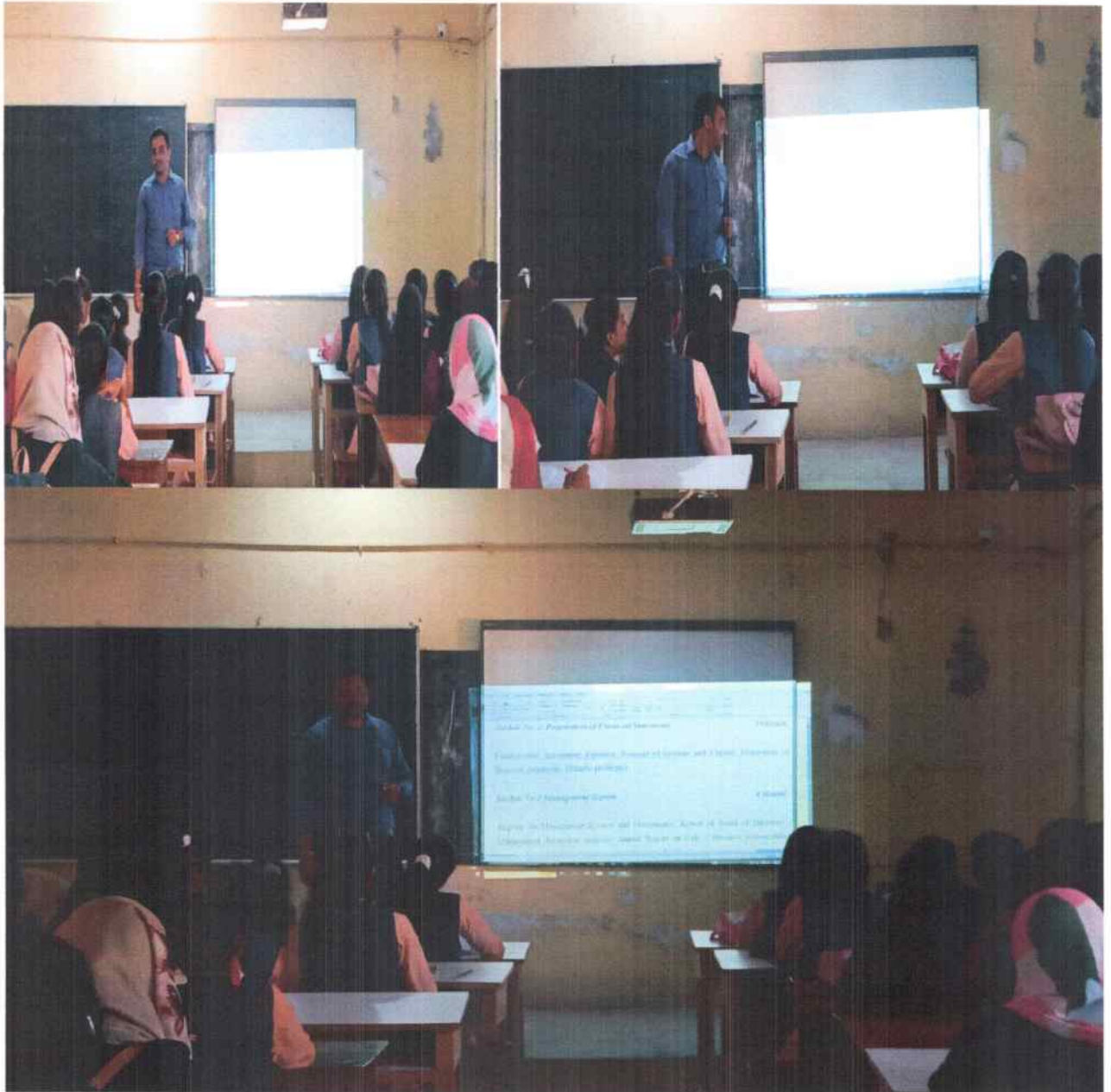
IQAC Co-ordinator S.S.R.G. Women's College, RAICHUR-584 101.